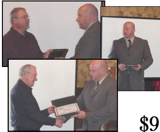
2009 Award Winners

This Chamber is organized for the purpose of advancing the quality of life, economic well-being, and awareness of the Maquoketa area so that our community will be a better place to reside and conduct business or professional endeavors.