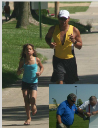
Timber City Days & Adventure Race Be sure to join us— June 25th