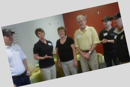
Maquoketa Financial Group Business After Hours