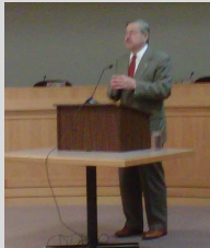
Governor Branstad's visit June 8th.